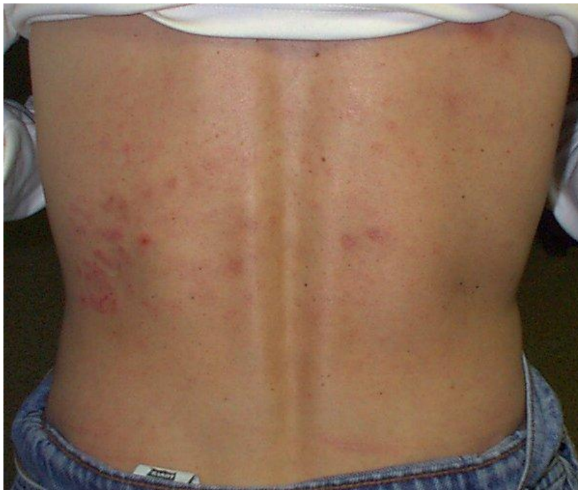
Most of the sores have disappeared by 2/5/01

The preceding photo was taken after taking m-state for a week and she had already noticed significant improvement. She also was putting m-state mixed with olive oil on her back. The sores were not as itchy and some of the open sores had closed. Another picture was taken on February 5, 2001: