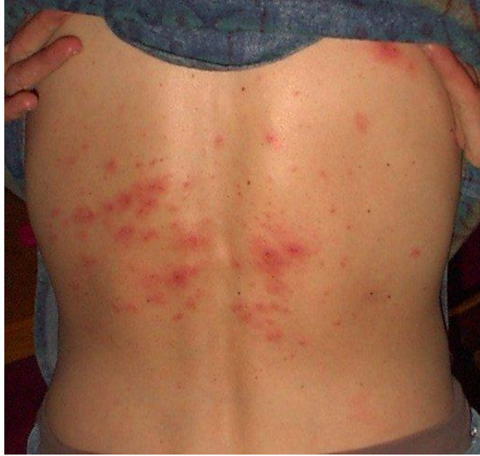
Open, weeping shingles sores on 1/13/01

The preceding photo was taken after taking m-state for a week and she had already noticed significant improvement. She also was putting m-state mixed with olive oil on her back. The sores were not as itchy and some of the open sores had closed. Another picture was taken on February 5, 2001: