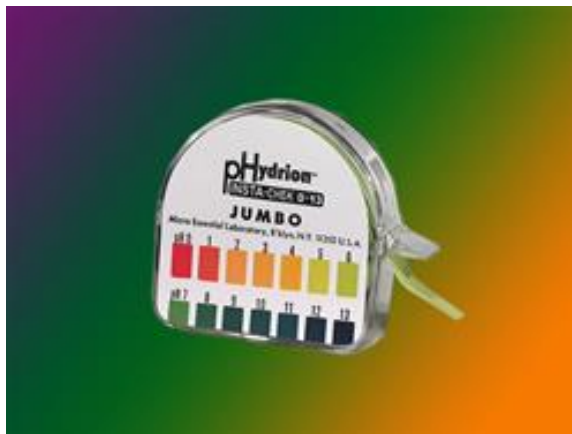
Ph Test Paper Strips

I test my saliva in the morning before I have brushed my teeth or eaten anything.